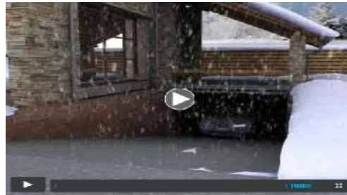
GX-RX Application Video

DANFOSS IS FOR INDUSTRY PROFESSIONALS ONLY!